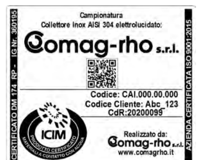
LABEL WITH QR CODE