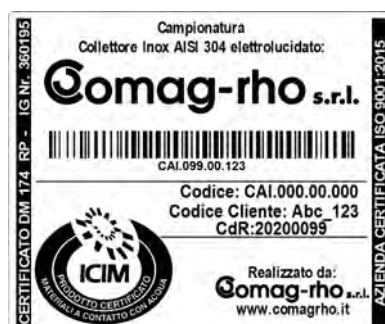
LABEL WITH BARCODE